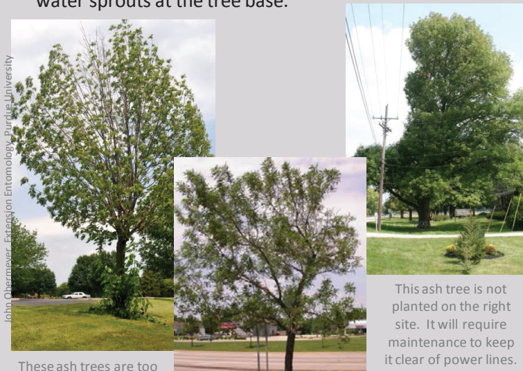
These ash trees are too unhealthy to be effectively treated.